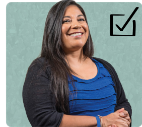
Karla Griego LAUSD BOARD DISTRICT 5