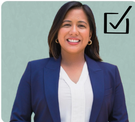
Ysabel Jurado LA CITY COUNCIL DISTRICT 14