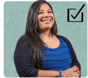
Karla Griego LAUSD BOARD DISTRICT 5